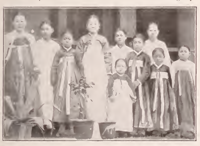
SEOUL CHRISTIAN WOMEN AND GIRLS.

The wonderful success God has given His servants in the past should spur us on to greater efforts in the future. God has opened wide the doors that once were so tightly